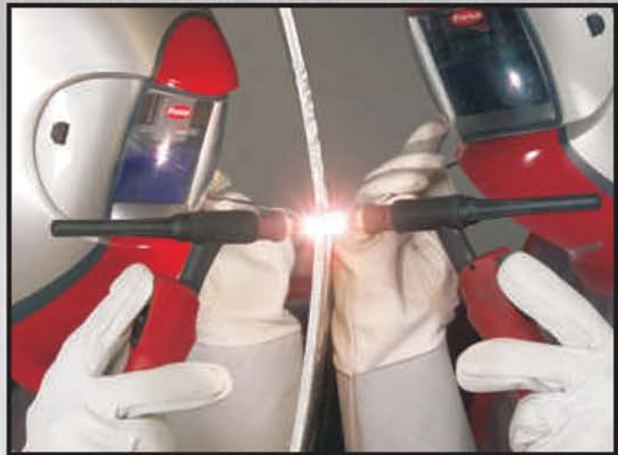
Mig & Tig Welding