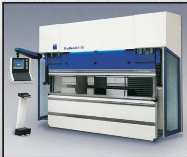
Folding & Bending

P.O Box 1102, Bayswater Business Centre Bayswater, VIC 3153 43 Malvern Street, Bayswater Vic 3153 Email: sales@newtouchfab.com.au